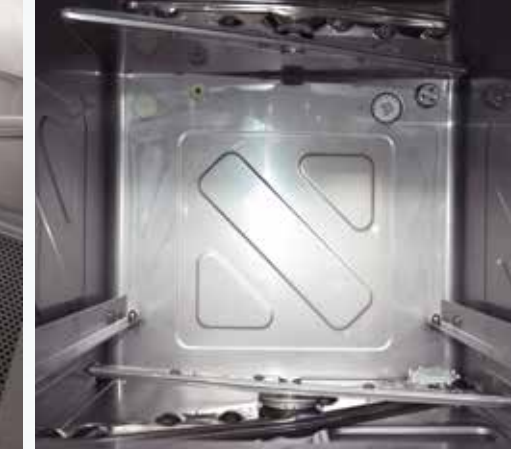
The inside of the washing tank.

Complete tank filters in stainless steel construction.