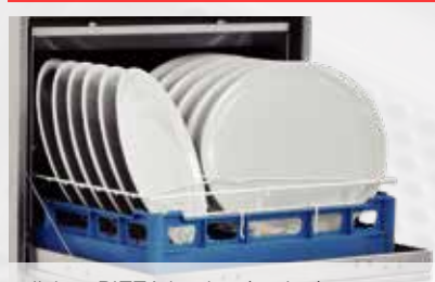
dishes PIZZA basket (option) COD. CC00034